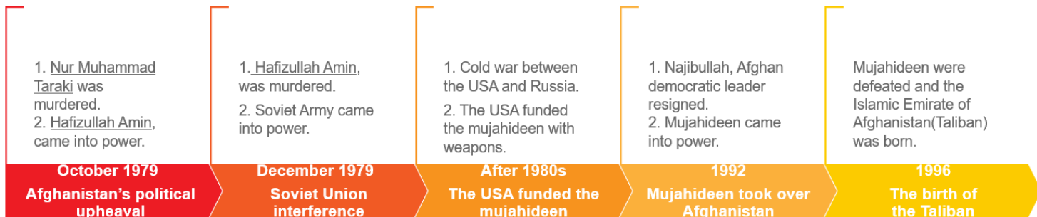
Timeline of the birth of the Taliban. Image created by the author.