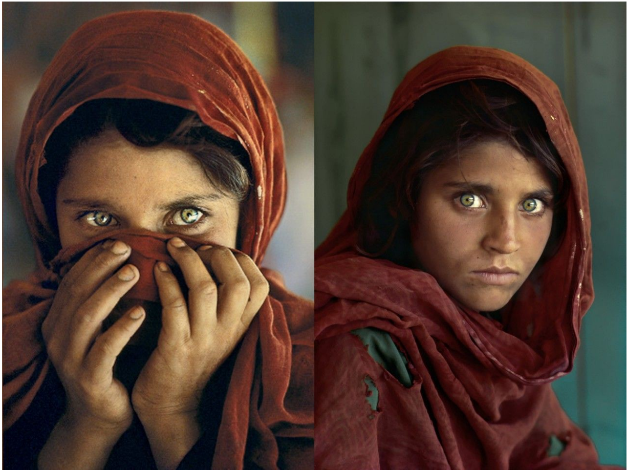
Sharbat Gula- A 10-year-old (now 49) refugee from Afghanistan who was featured in the 1985 cover of National Geographic is still an emblem of the refugee crisis.