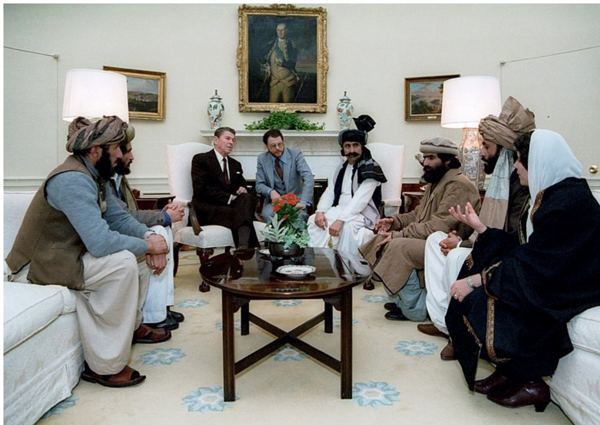
Reagan hosts Afghan-Mujahideen leaders in the White House in 1985.

Finally, in 1990, the Soviet Army backed out as it was struggling its own battle of splitting into countries — Russia winning the majority.